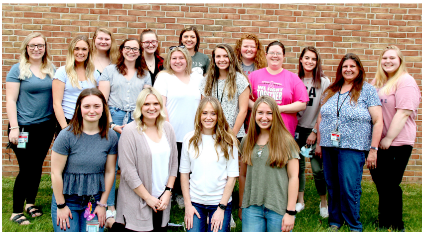
The team with the Little Acorns ABA Therapy Program at CMH works hard with each family to develop and achieve individual goals for children with autism.